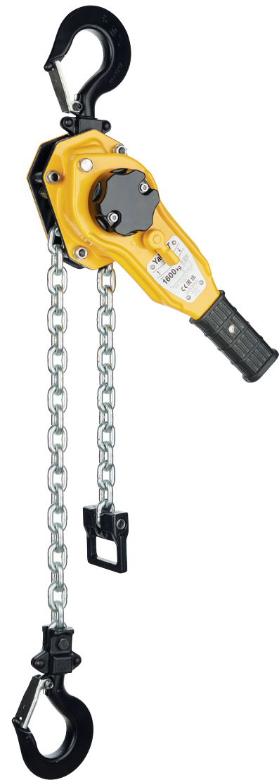
Yale PT-B CAPACITIES 800 – 6300 KG

Allows handle to rotate freely when hoist is overloaded, preventing damage to the unit. Load limiter units feature a black hand wheel for quick and easy on-site identification.