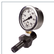
Pressure gauge set GYA-63 is part of the scope of delivery.