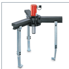
Accessories for BMZ-2300 and BMZ-2311: BMZ-2308 extensions of pulling arms increase the reach (A) up to 395 mm. BMZ-2309 up to 495 mm.