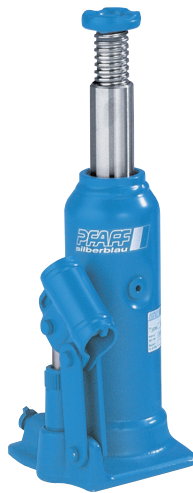
HWH KS, 5t