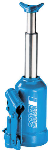
HWH 2K, 3t