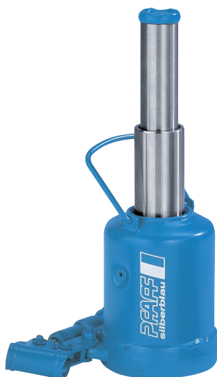
HWH 2K NB, 10t