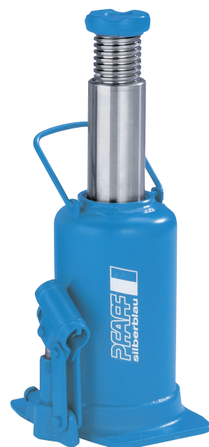
HWH KS, 20t