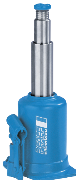
HWH 2KS, 10t