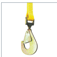
GKH - with twisted snap hook