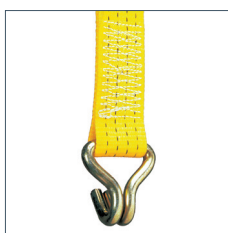
SPH - with double J hook