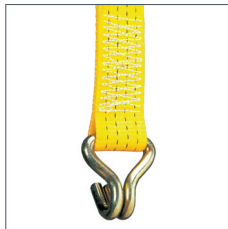
SPH - with double J hook