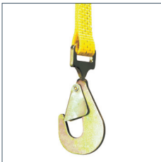
GKH - with twisted snap hook