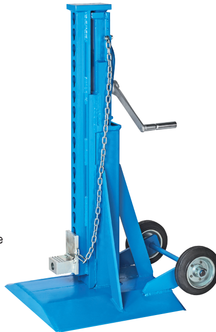
KHB 5 capacity 5000 kg