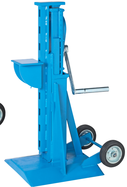
KHB 8 capacity 8000 kg