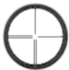
Filar/bifilar reticle pattern

All configurations of this instrument include a telescope having adjustments to maintain the line of sight straight throughout a focusing range of two inches to infinity, allowing the instrument to be located in the tightest of setups. This straightness is maintained at \pm 0.001 " (0.025mm) from two inches to 17 feet (50.8mm to 5.2m) and one arcsecond from 17 feet to infinity. The main telescope tube has a removable section to facilitate conversion for autocollimation, autoprojection, or installation of a right angle eyepiece. The optical micrometer produces repeatable readings with a resolution of 0.001" (0.025mm).